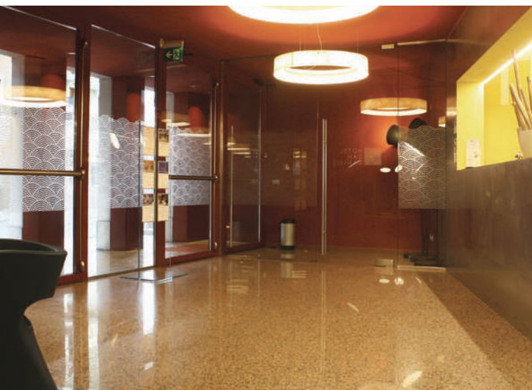
Left: the lobby ... today!