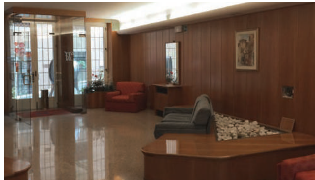
Top right: the lobby before refurbishing