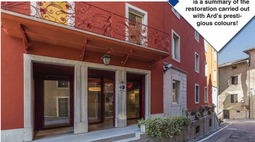
Photo: an exterior view of the hotel and one of Ard's colours .....

The Hotel San Daniele is in the heart of San Daniele del Friuli ... here is a summary of the restoration carried out with Ard's prestigious colours!